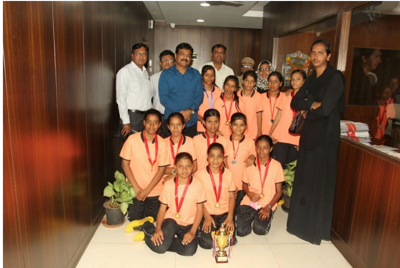
TMC school students at the Municipal Corporation after winning a tournament

The Parcham football initiative reached a milestone this year as the Thane Municipal Corporation partnered with Parcham to introduce football in the Municipal Schools in Mumbra. Our volunteer trained the students over the year reaching out to the 13 schools in the school complex at Kausa Talav.