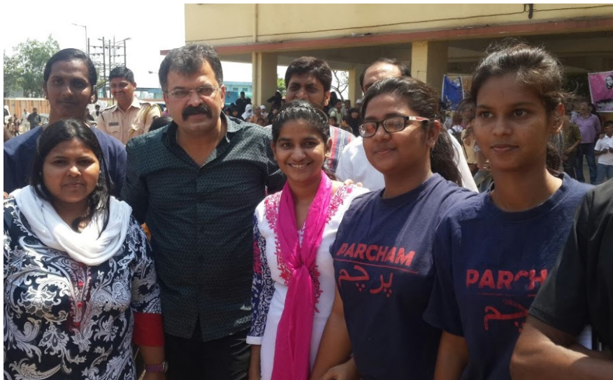
The Parcham team with Chief Guest, M.L.A Jitendra Awhad