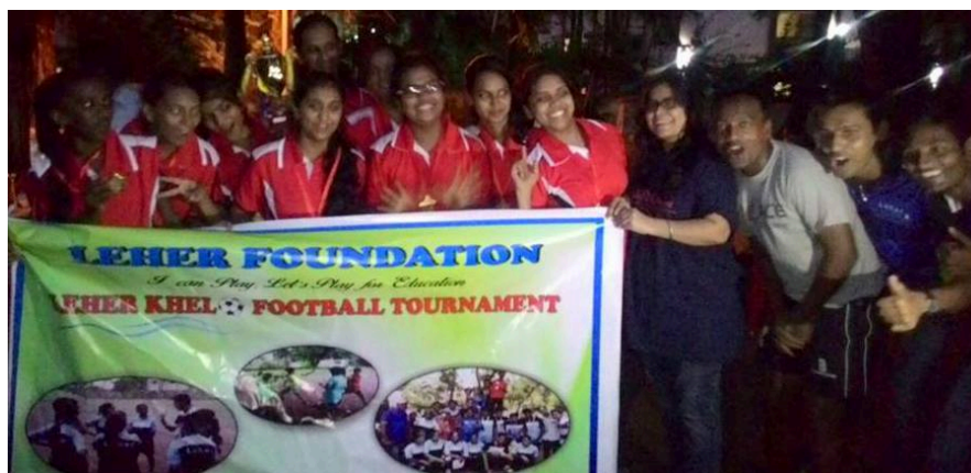
With the trophy at the Leher Tournament

This year the Parcham team participated in a number of tournaments over the year. We won the Leher tournament and the Runner’s Up at the Oscar Tournament.