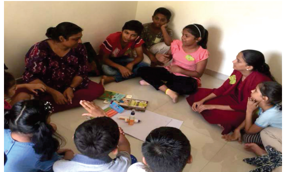
Preparing the Skit, making puppets and performing